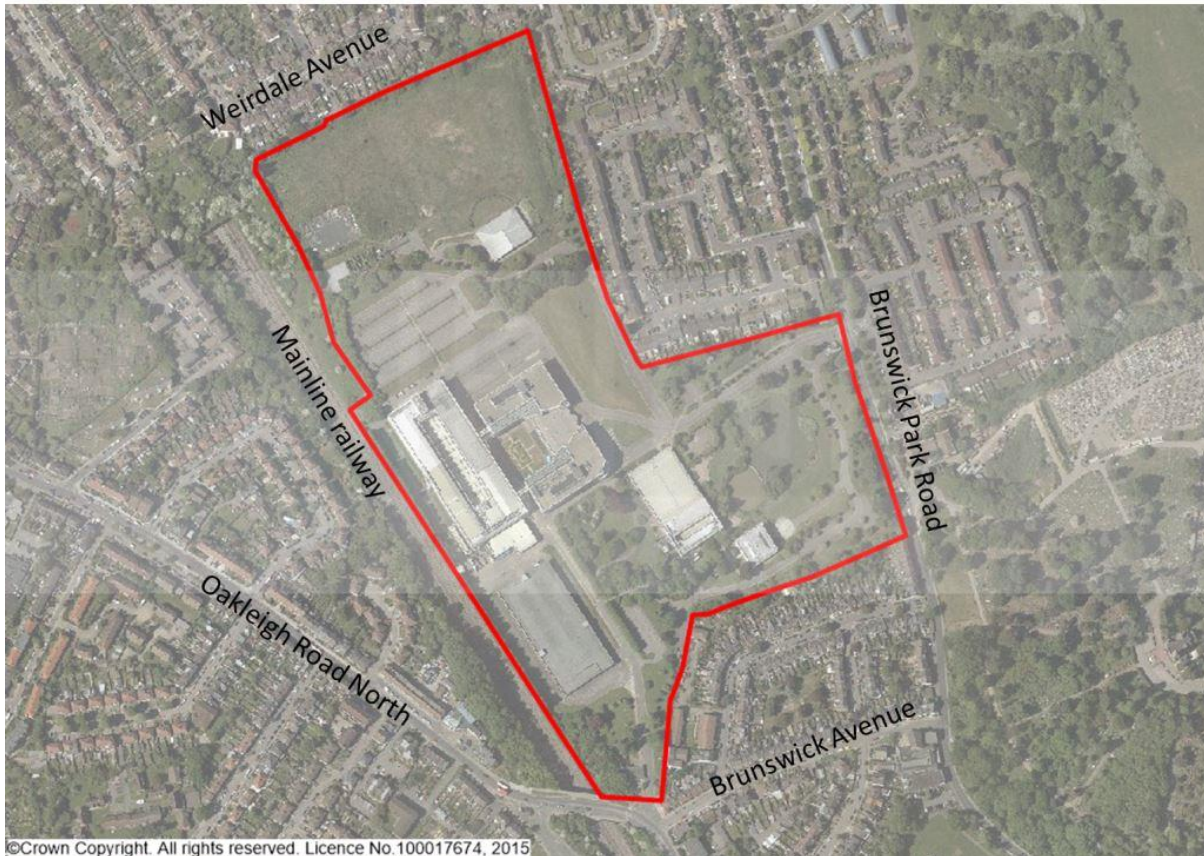
Map 1: NLBP context

3.4 NLBP is located between two national rail stations, New Southgate and Oakleigh Park. London Underground Piccadilly line services can be accessed at Arnos Grove. Bus services (routes 34, 251 and 382) are available from Oakleigh Road South and Brunswick Park Road.