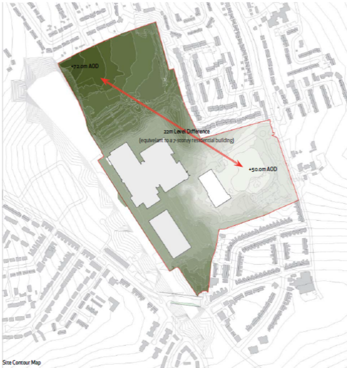
Map 2: NLBP Site Contour